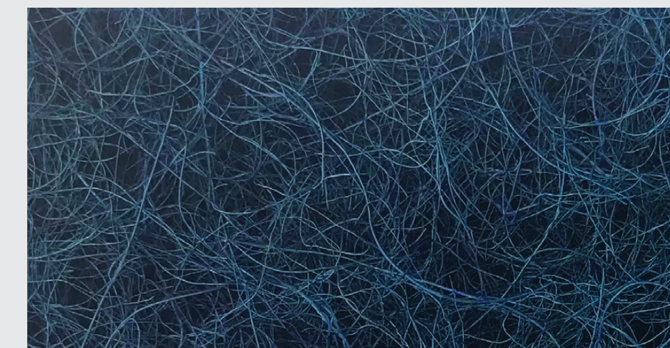
Media Front Closeup