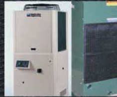
Cooling Equipment Air Intakes Portable Chillers And 125 Ton Cooling Tower