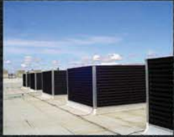
Office Building Rooftop Economizers