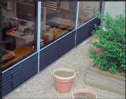
University Classroom Fan Coil Unit Air Intakes