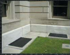
Michigan State Capital Building Ground Louvers