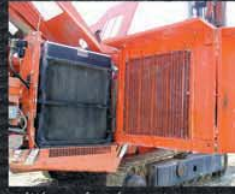
Drilling Rig Air Intake