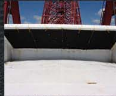
Youngquist Brothers Rock Quarry Dragline Equipment Air Intake