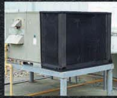
Physics Laboratories HVACR Equipment

©2009 Permatron Corporation Patent No. US 6,793,715 The 'USGBC Member Logo' is a trademark owned by the U.S. Green Building Council and is used by permission.