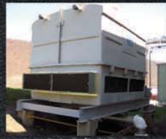
Osram Sylvania Plant Thermal Care Cooling Tower