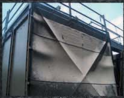
Willoworeek Church Marley Cooling Tower