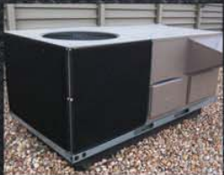
Office Building Rooftop AC Unit