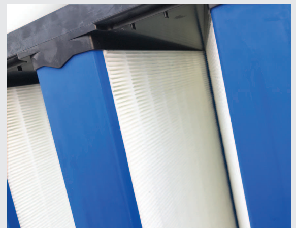
Mini pleat closeup